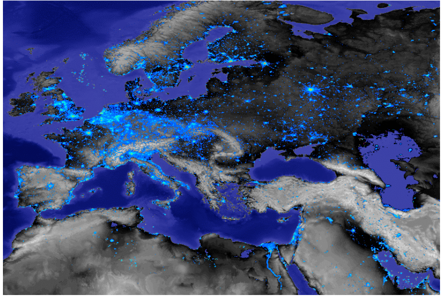
Fig. 1: Light pollution in Europe.

Here is a beautiful image of light pollution visible at night from Europe!