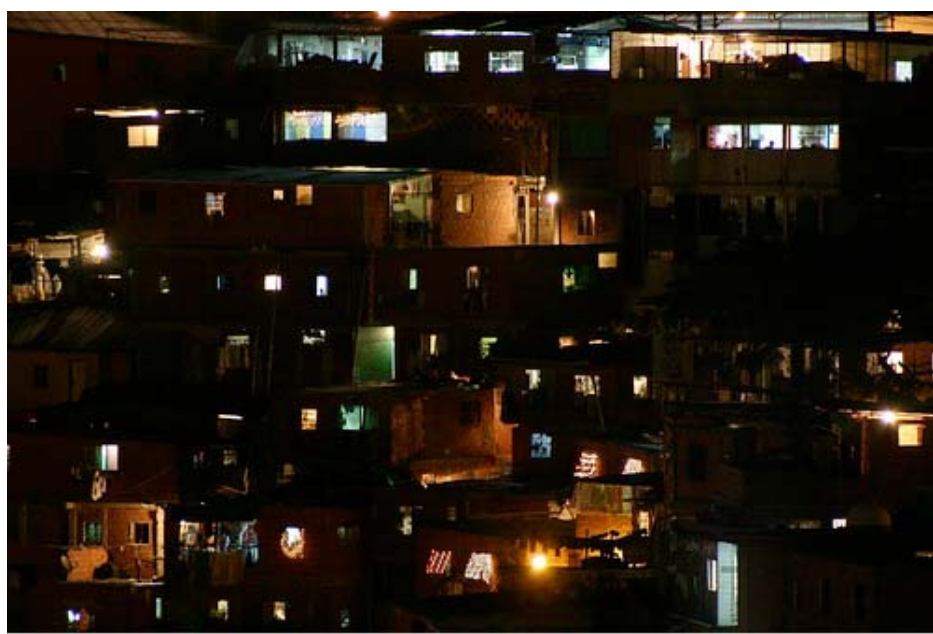
Figure 2: Ranchos of Caracas at night

When I decided to gather this story for you, I had to imagine showing you how such a metaphor might be conceived. It did not prove too difficult to illustrate this. All I had to do was to go to Flickr.