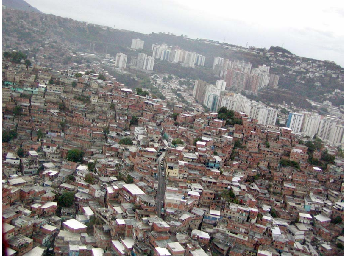
Figure 4: Aerial photograph of Petare taken from a helicopter. An ocean of stories to be told?

This is fortunate for me, using such an "unsmart", text-based channel such as Web 1.0 to gather stories about the city and its everyday life.