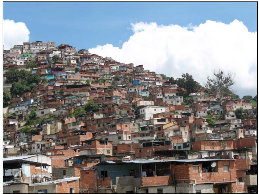
Figure 3: On the way out to Maiquetía airport.

The earlier image contrasts with the view that reveals itself in the light of the day. For example, here is a picture that I took myself on my way to the airport a few weeks ago. Please note that even though they look similar, neither image is Petare .